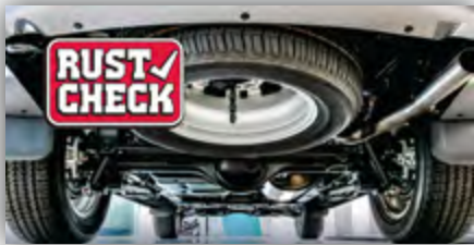
YOU TOO CAN WIN ONE FREE RUST CHECK ANNUAL SPRAY AT ANY RUST CHECK DEALER! ENTER FOR YOU CHANCE!